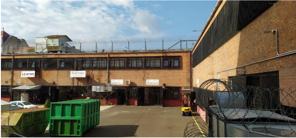
Employment department in the Object

On 15 September 2023, the Commissioner for Fundamental Rights of Hungary, responsible for performing the tasks of the National Preventive Mechanism, and his staff members visited the Balassagyarmat Prison and Detention Centre (hereinafter: the "Facility").