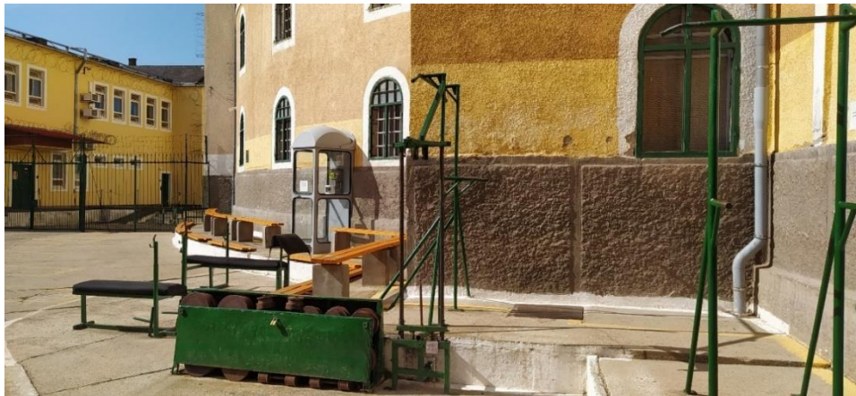
Sports and walking yard of the Balassagyarmat Prison